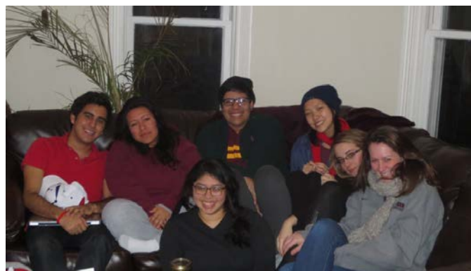
Left. Students during WGSS winter study in Uganda. Right. Class screening of M. Butterfly for Queer of Critique seminar.